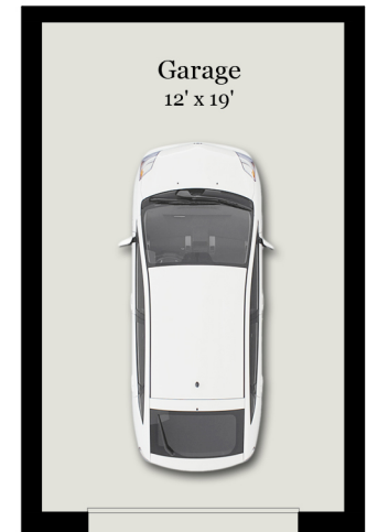
LOWER LEVEL 240 SQ FT

Estimated Total Square Footage: 1,035 SQ FT